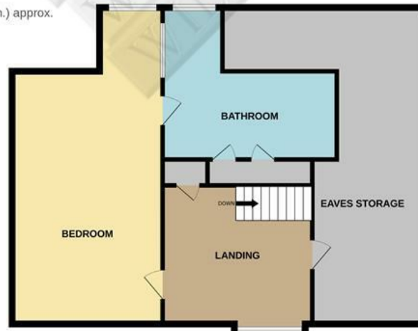
TOTAL FLOOR AREA : 2499 sq.ft. (232.1 sq.m.) approx.

Whilst every attempt has been made to ensure the accuracy of the floorplan contained here, measurements of doors, windows, rooms and any other items are approximate and no responsibility is taken for any error, omission or mis-statement. This plan is for illustrative purposes only and should be used as such by any prospective purchaser. The services, systems and appliances shown have not been tested and no guarantee as to their operability or efficiency can be given. Made with Metropix ©2023